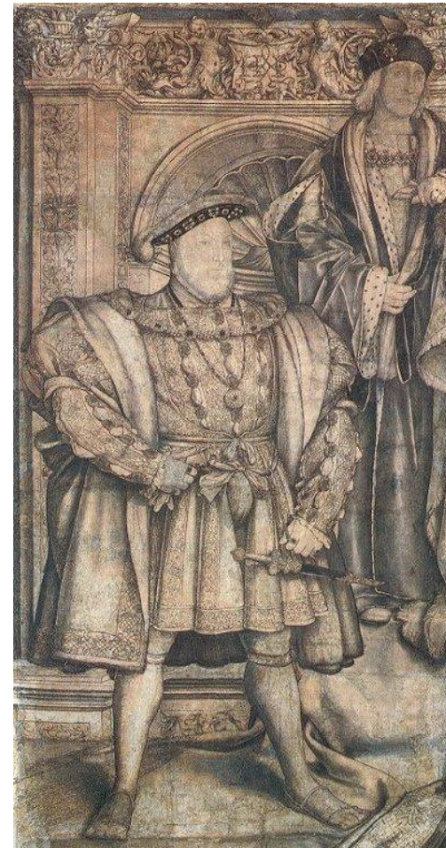
King Henry VII and King Henry VIII Hans Holbein the Younger 1536-7 Ink and watercolour on paper 101 ½ x 54 in. (257.8 x 137.2 cm) National Portrait Gallery, London [NPG 4027]